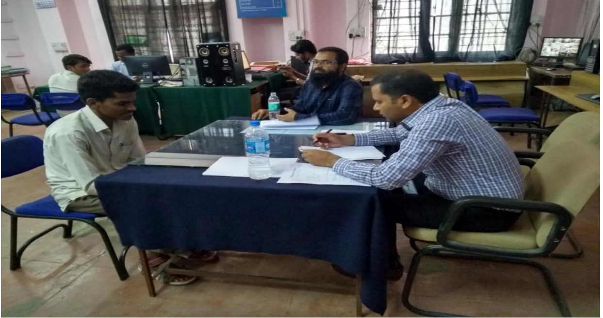
Students Attending Interview