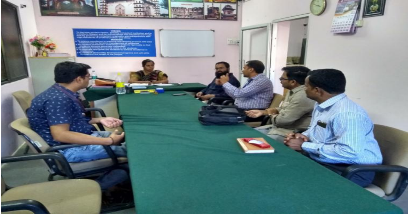
H.R Manager with Placement Cell Members